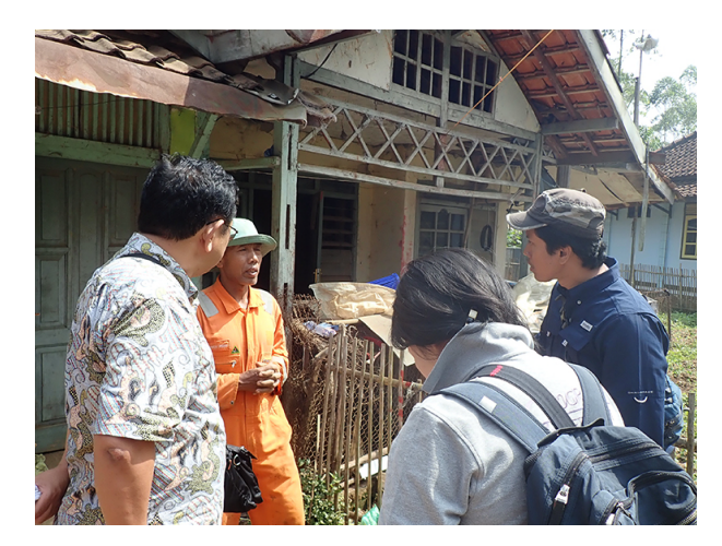
Meeting with miners