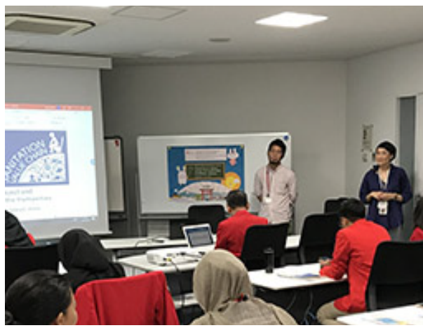
Students attending special sanitation lectures at Research Institute for Humanity and Nature (RIHN)