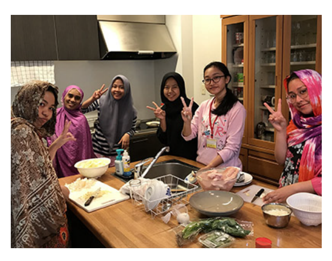
Students taking part in a cooking activity at Research Institute for Humanity and Nature (RIHN).