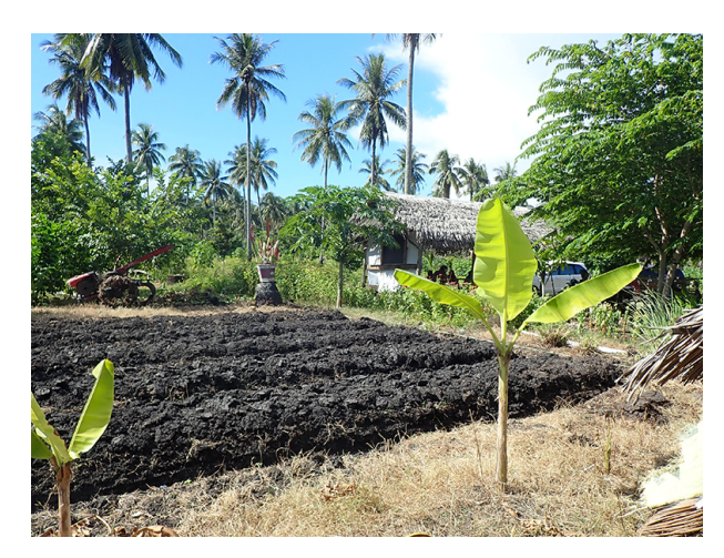
Creating argriculture plot

The purpose of our FR is to understand the link between poverty reduction and environmental management and to establish a process for constructing sustainable societies through regional innovations in collaboration with stakeholders in ASGM areas and to strengthen related environmental governance in developing countries. In our FS, we will conduct the following three levels of research based on a transdisciplinary approach, within the scope of Association of Southeast Asian Nations (ASEAN) countries: a) case studies of reductions in Hq pollution using a future scenario in ASGM areas of Indonesia and Myanmar; b) study of regional networks that aim to generate Hg-free societies communities in Indonesia and Myanmar; and c) study of improvements in environmental governance in ASEAN countries.